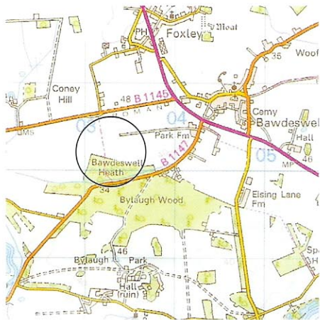
Image produced from Ordnance Survey's (Internet) Get-a-map service, reproduced with permission of Ordnance Survey.